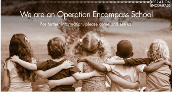
SPERATION ENCOMPASS In every force. In every force. In every school. For every child.

Operation Encompass is a police and education early information safeguarding partnership enabling schools to offer